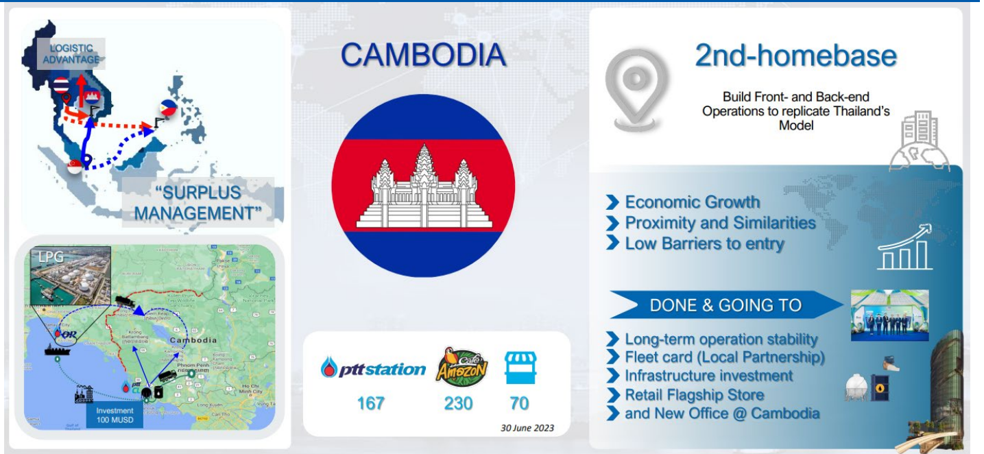
Figure 1: Cambodia – a key strategic global market for OR